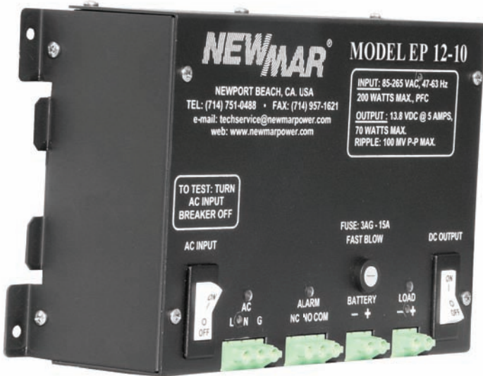
Power Supply, battery charger, alarms, and low voltage disconnect all in one unit.